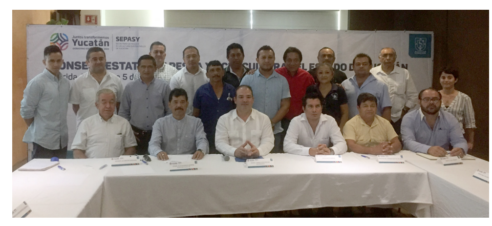
Species catalog Improvements

A simple logbook was designed for fishers to use with the newly created species catalog and these were made available to fishers.